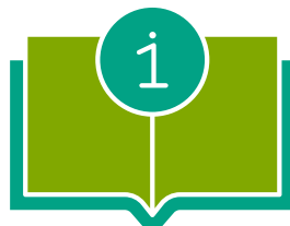
Able to follow instructions