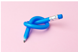
A flexible attitude