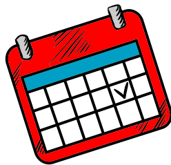
Good at planning