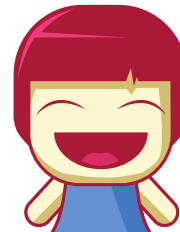
Sense of humour