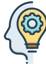
Attention to detail