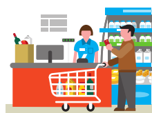
Customer Services Assistant