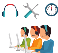
Call centre operator