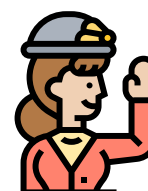
Airline customer service adviser