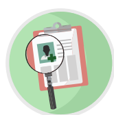
Attention to detail