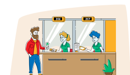
Financial customer service adviser