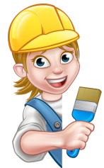
Painter and Decorator