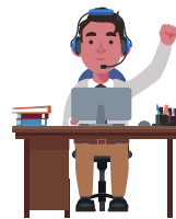
Customer Service Assistant